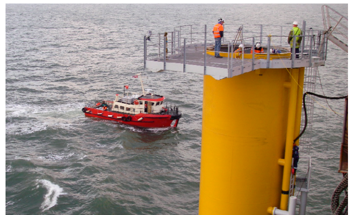
Connections to Foundations

The 33 Vestas V117 – 4.2 MW wind turbine installation is scheduled for April 2022. Once fully commissioned, the renewable energy source will go beyond providing electric power to the region and result in fewer emissions than traditional means of energy production.