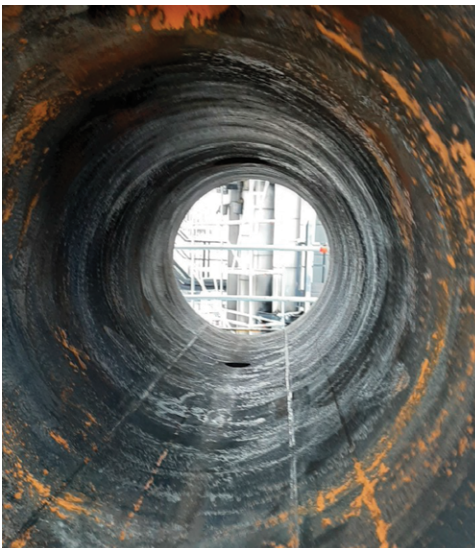
Original tube surface

Devcon Brushable Ceramic Blue Coating provides long-lasting corrosion protection in harsh environments withstanding numerous years of continual use. Protect your equipment, extend the life, and minimize future hazardous maintenance cycles with Devcon coatings.