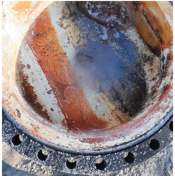
Original Oxidized Heat Exchanger

The unit was quickly returned to service and is still withstanding the corrosive nature of the process, thereby meeting customer expectations.