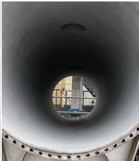
Prepped tube surface