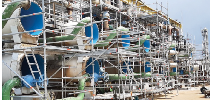
Area where the work was performed

Devcon Brushable Ceramic Blue Coating provides long-lasting corrosion protection in harsh environments withstanding numerous years of continual use. Protect your equipment, extend the life, and minimize future hazardous maintenance cycles with Devcon coatings.