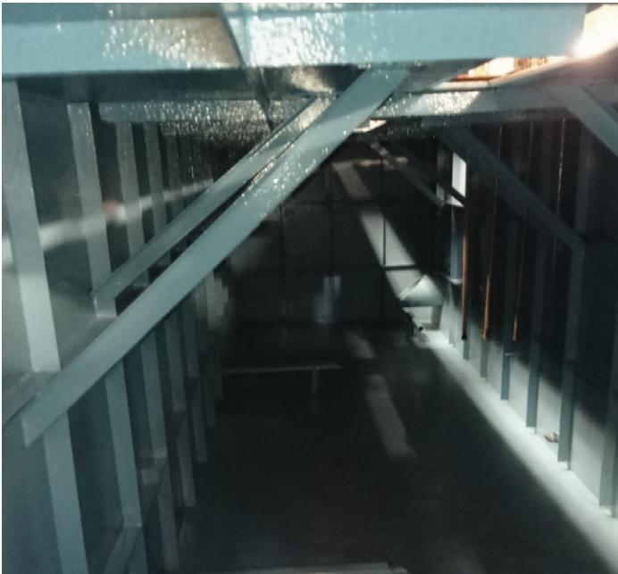
After coating with two layers of Devcon® EZ-Spray Ceramic Blue