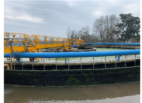
Clarifier processing wastewater