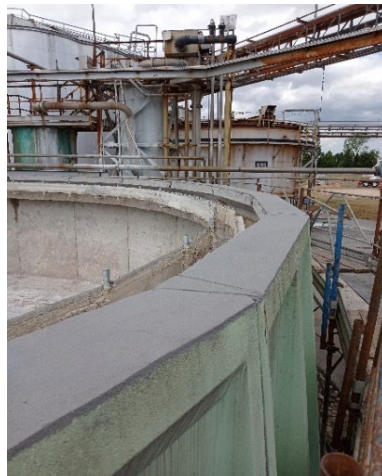
Devcon Floor Patch ready to enter service