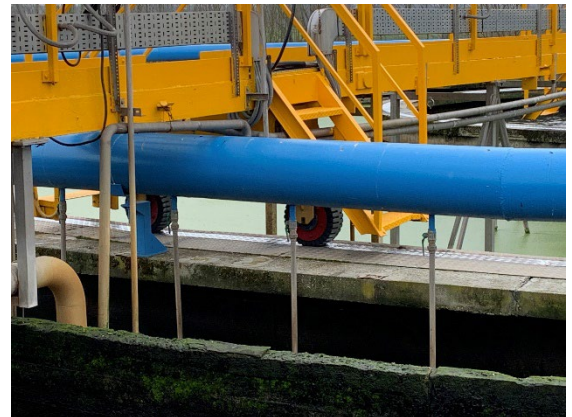
Clarifier track in production