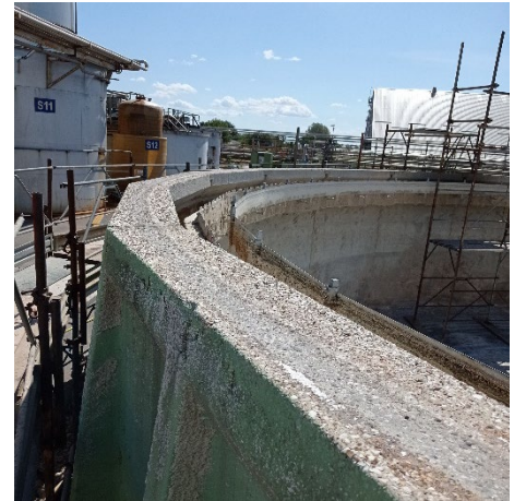
Concrete surface prepared for Devcon Floor Patch

The wear-resistant properties of Devcon Floor Patch along with its durability and ease of application enabled the customer to reduce their repair time and achieve their maintenance goals.