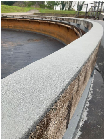
Surface finish of applied Devcon Floor Patch