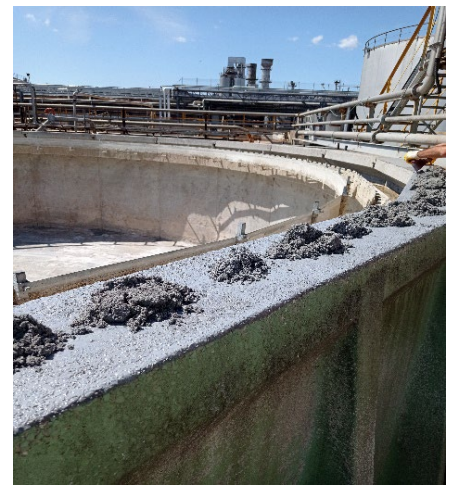
Devcon Floor Patch application