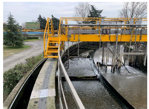
Equipment after one year in service – Devcon Floor patch withstands mechanical stress while protecting concrete from chemical and biological attack