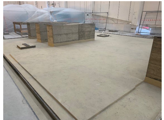
Production floor after coating application