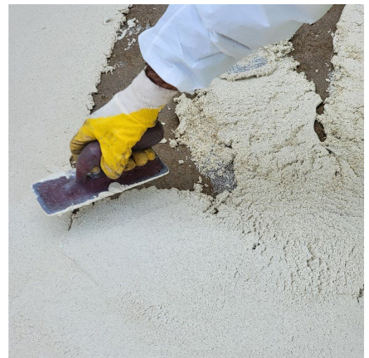
Devcon Ultra Quartz application