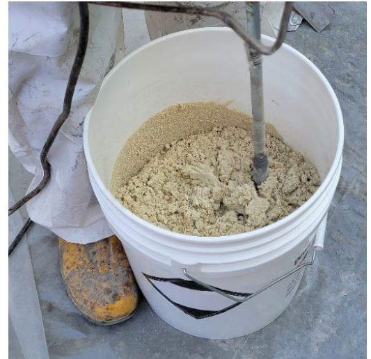
Mixing Devcon Ultra Quartz