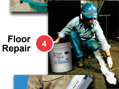
4 Floor Repair