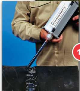
10 Rubber Repair