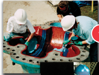
1 Metal Repair