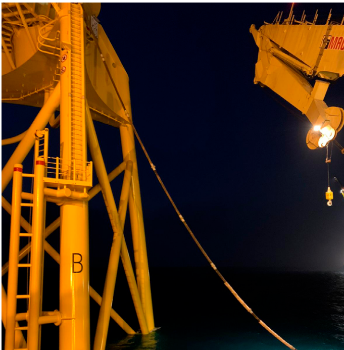
Continuous grout pumping through the night