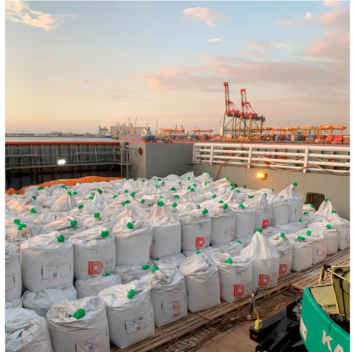
Densit Ducorit S5R

The construction started in 2021 and was finished in August 2022. Upon completion, the three-legged jacket foundation firmly stand, adding to the long-proven track record of successful Densit grouted foundations in Taiwan.