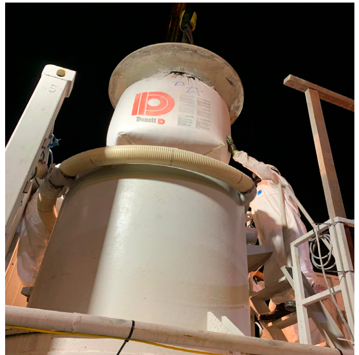
Mixer spread and 2 ton Densit grout bag