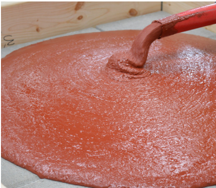
Chockfast Red Versaflow delivery via hose

Products tested per standard kit component ratios and identical methods.