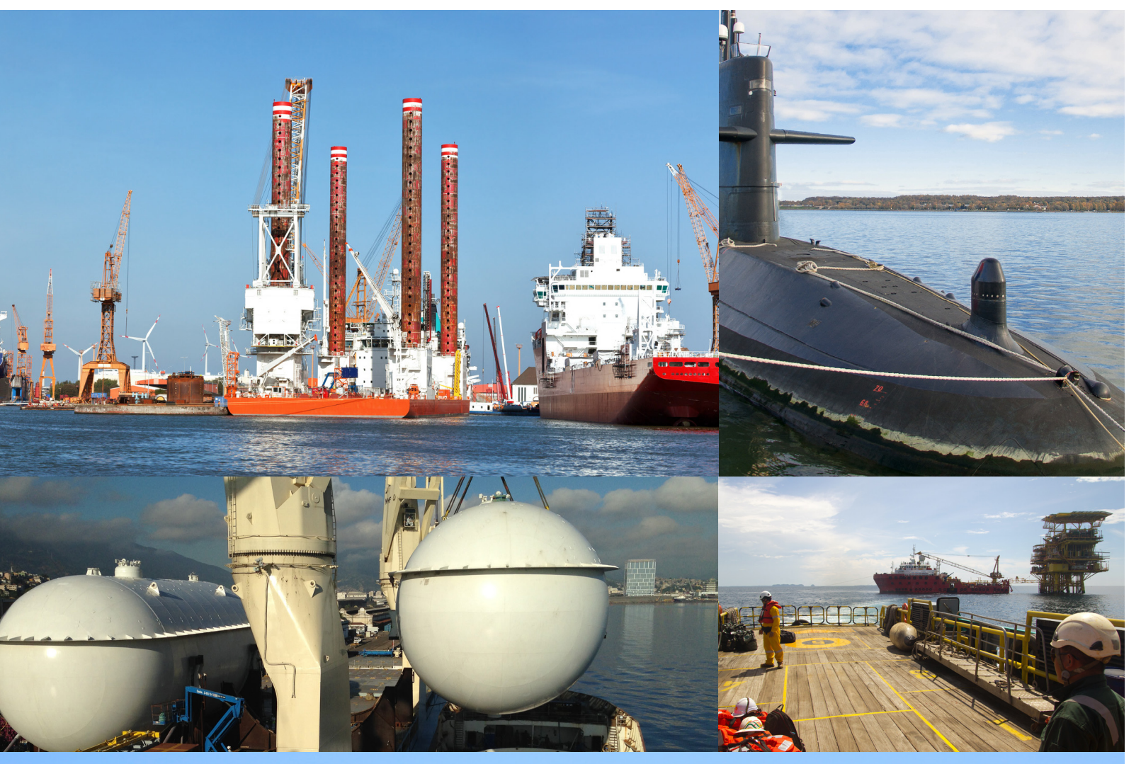
Chocking solutions for your business